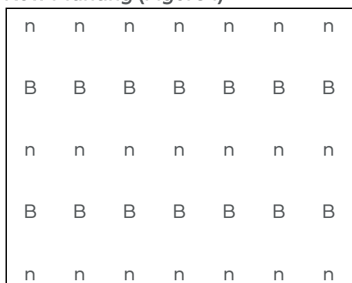
Row Planting (Figure 1)